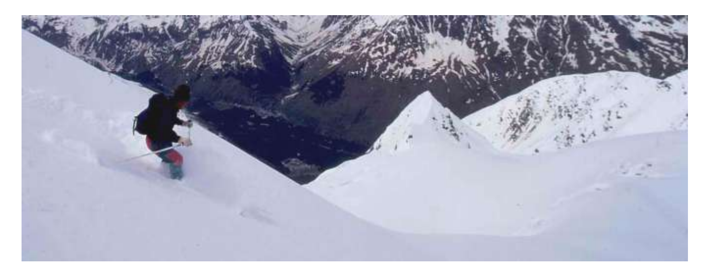
Day 8 Transfer to Piatigorsk (200km). (Option: morning transfer along the way and ski tour to peak Mukhu 3060m.) Hotel Intourist