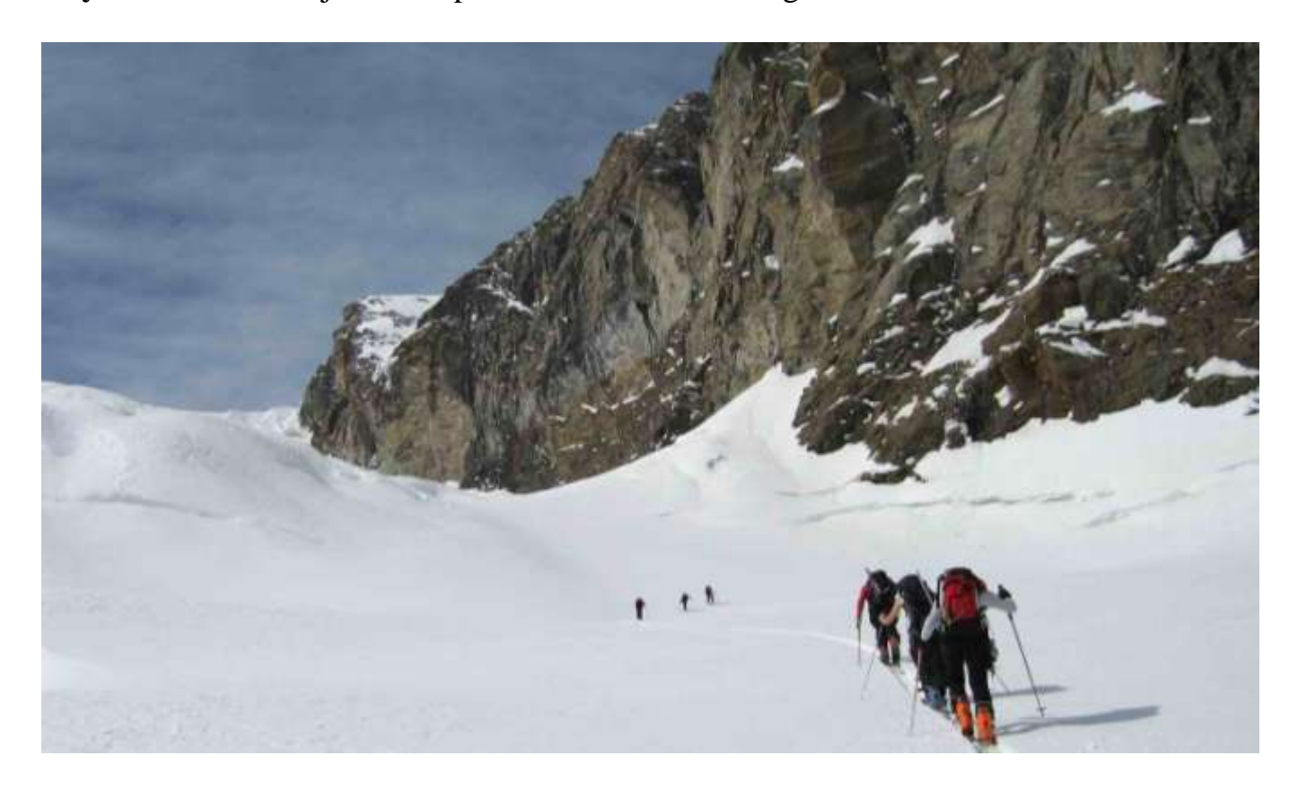
Day 7 Ski tour to Djalovchat pass 3200m. Alibek refuge.