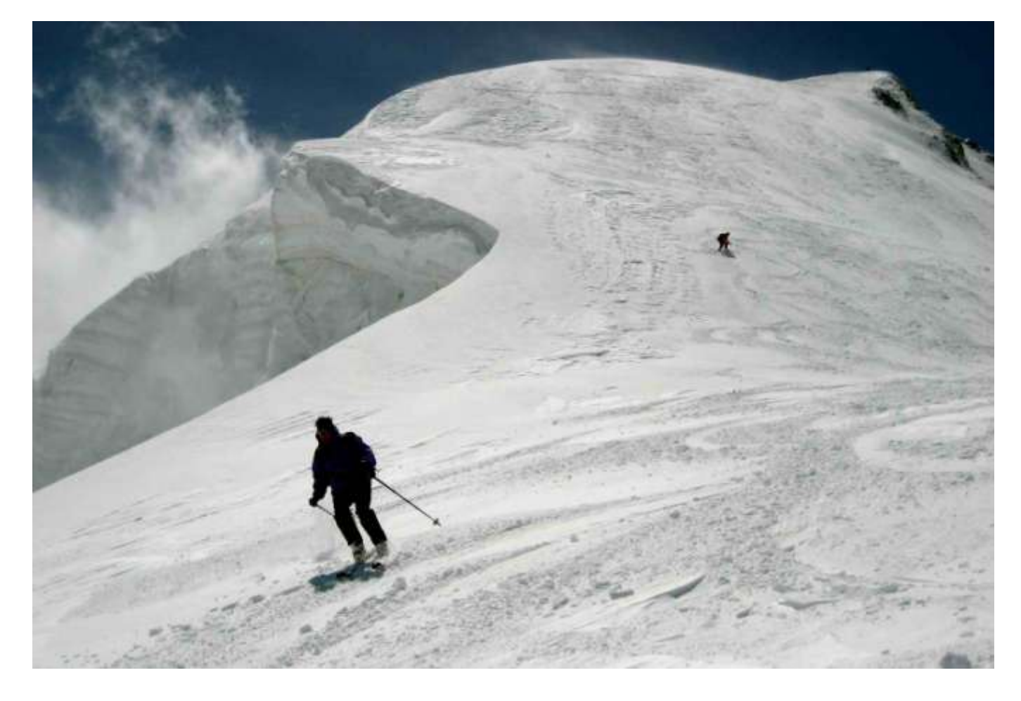
Day 6 Ski tour to peak Kichi-Djuguturluchat 3720m. Alibek refuge.